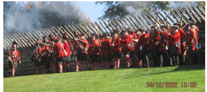
Fort Ligonier Days, 2022

WVRA website - wvra.org Chuck Critchfield - Editor 608 Skyview Drive Clarksburg, WV 26301 ccritch608@yahoo.com